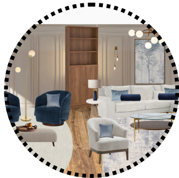
Moodboard, Sourcing Document and Specifications