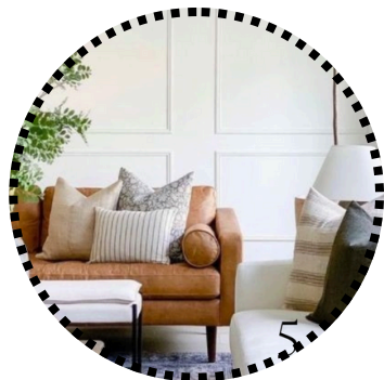
Design style options